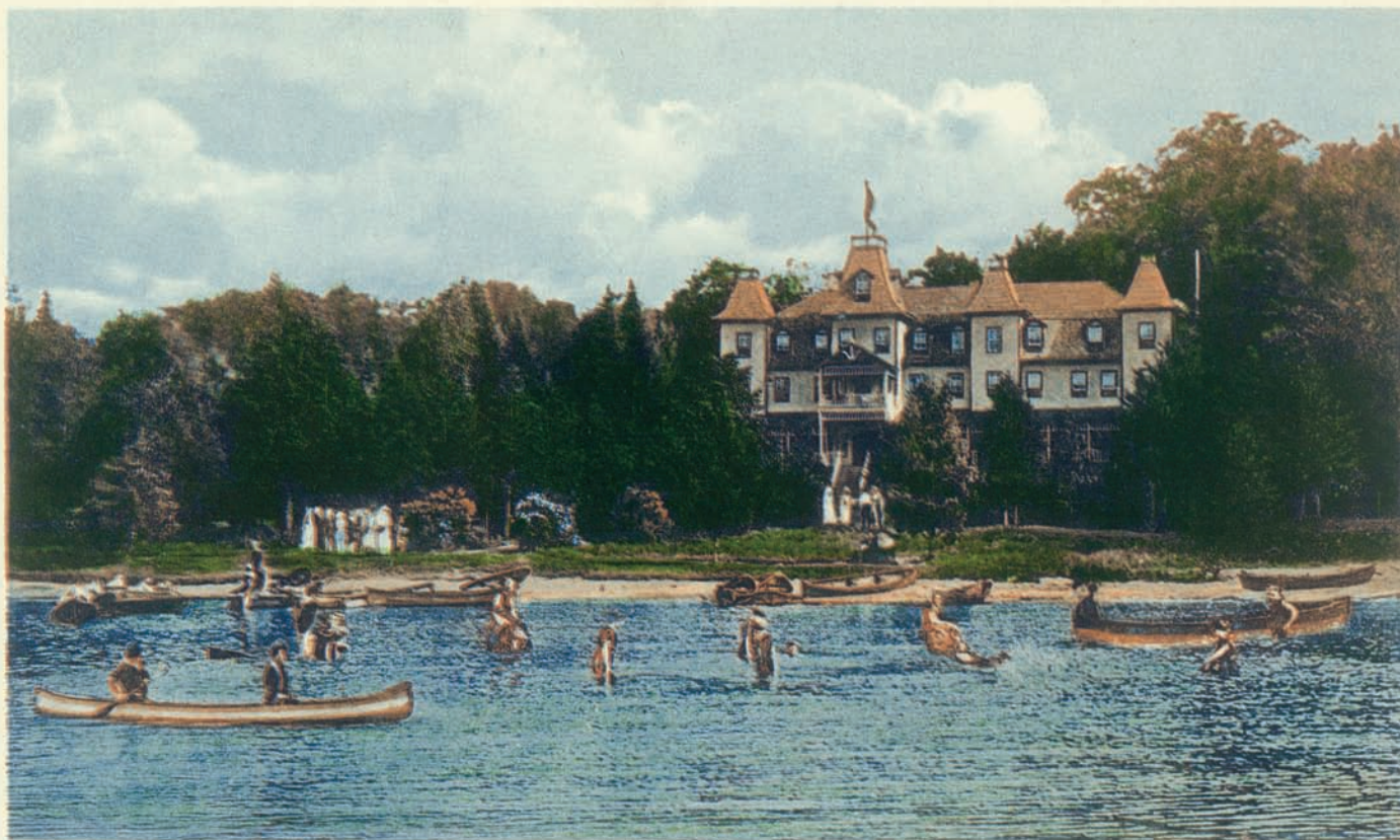
"BELMONT HOUSE," PINELANDS, LAKE JOSEPH, MUSKOKA-LAKES, ONTARIO, CANADA.